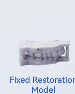
Fixed Restoration Model