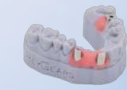
Implant Model + Gingiva Mask